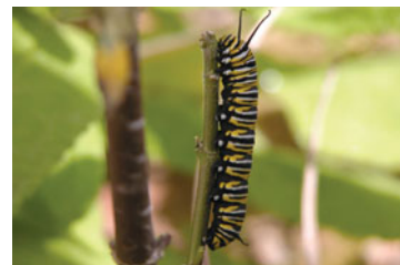
Monarch butterfly caterpillar on Asclepias spp.

Attracting butterflies to your garden is a rewarding way to foster a healthy population of beneficial insects. Witnessing the arrival of the graceful, multicolored beauties in your yard is evidence that by providing habitat and eliminating the use of chemical sprays, nature can restore balance to itself. Drought tolerant native plants are beneficial for species-specific native butterflies that depend on just one or a few types of plants as larval hosts.